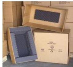
Boxes w/ Cushions